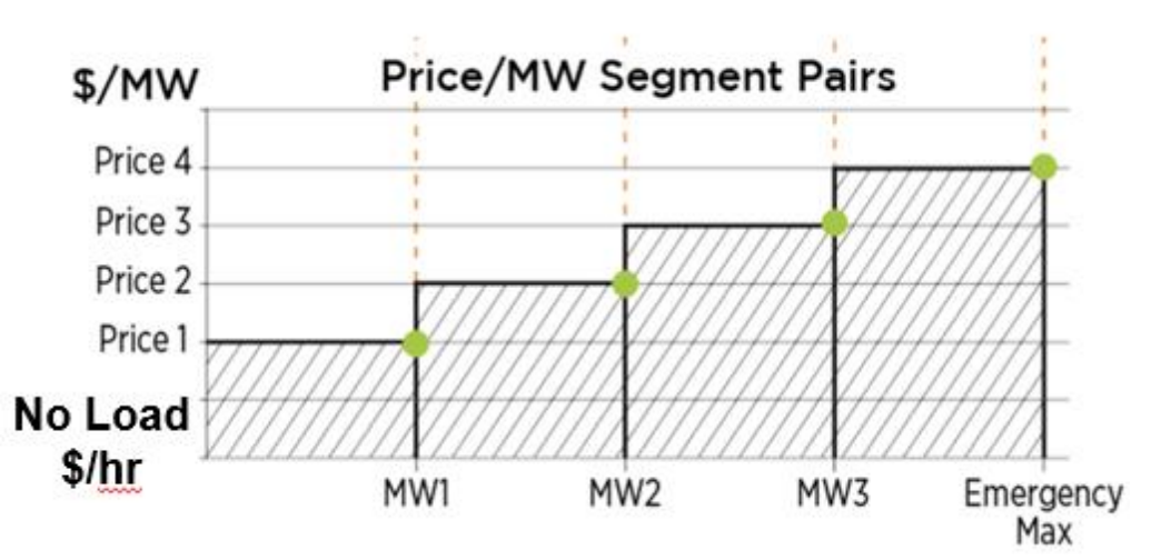
Figure 2 – Bid Production

Bid Production Cost represents the sum of all the segments prior to and including the segment under review, plus the generation resource's No-Load Cost. In Figure 2 below, the Bid Production Cost for the Emergency Max is equal to the entire shaded area under the curve (i.e., Price 4 + Price 3 + Price 2 + Price 1), plus the No-Load Cost. Segment "zero" on Figure 2, which is the price at which the generating resource can produce zero MW, is always calculated using "Use Bid Slope" = 0.