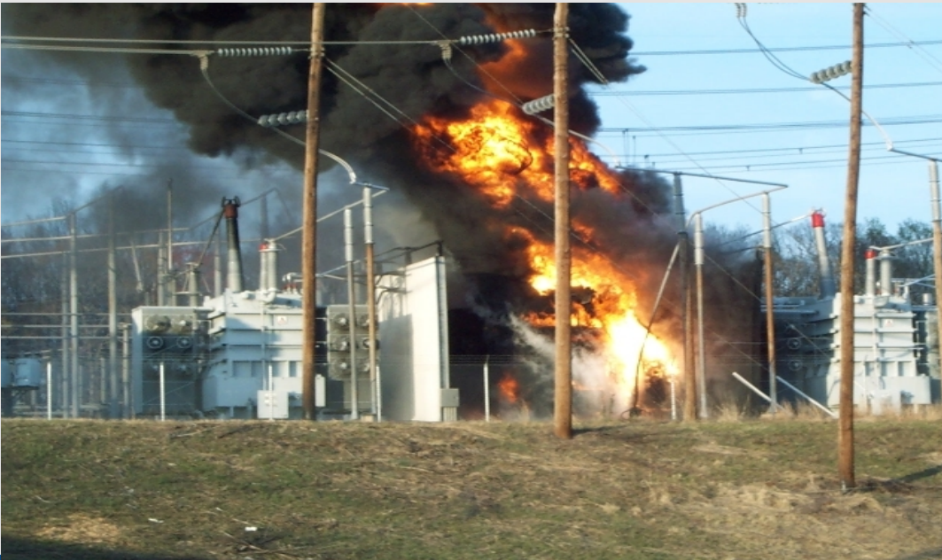
500 kV Transformer Failure in 2000