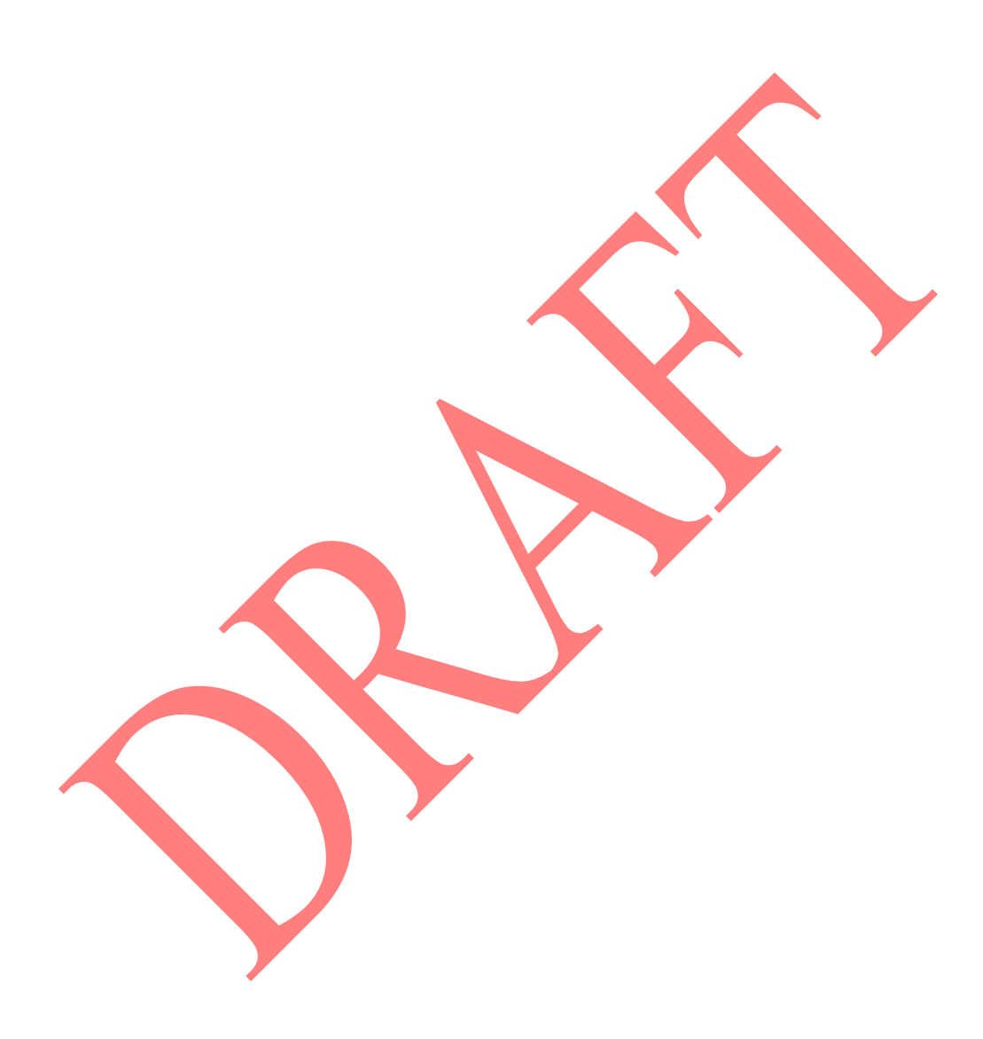
only. Project Developer shall submit machine modeling data as specified in the PJM Manuals associated with the Permissible Technological Advancement before the close of Decision Point II.