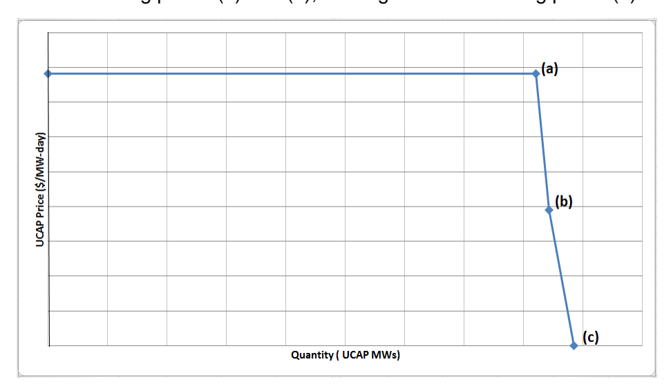
Exhibit 1: Illustrative Example of a Variable Resource Requirement Curve

The graph below illustrates the process for plotting the Variable Resource Requirement curve. The VRR Curve is plotted by combining a horizontal line from the y-axis to point (a), a straight line connecting points (b) and (c).