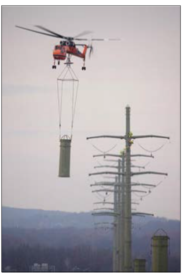
Susquehanna Roseland Project