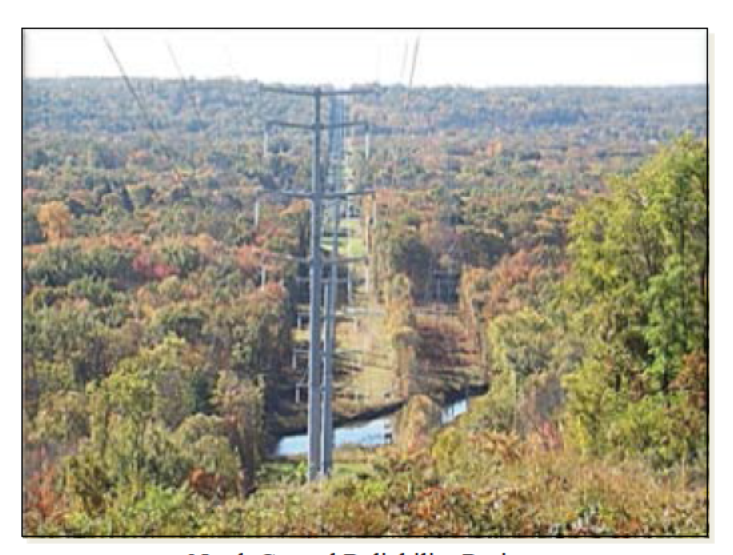
North Central Reliability Project

Clockwise from top left: stringing conductor on the Mickleton-Gloucester-Camden Project; using the air crane to set tower sections on the Susquehanna Roseland Project; overview of the North Central Reliability towers and right-of-way; and overlooking the new Burlington station from the Burlington-Camden Project.