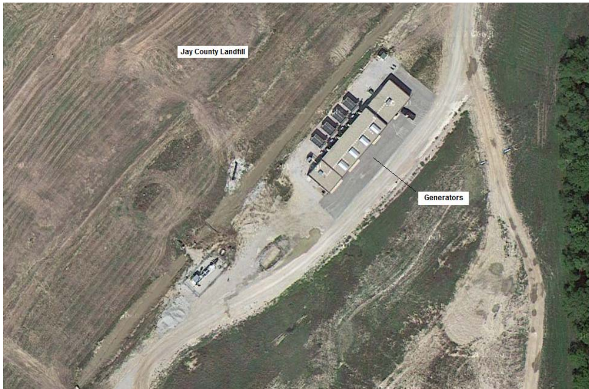
Figure 1 – Jay County Landfill located in Portland, IN

The facility was in-service April 13, 2005. Due to wholesale load switching beginning June 1, 2015 Wabash Valley will not have any load to net the resource against so Wabash Valley would like to convert the facility from Behind-the-Meter to a Generator for capacity and energy settlement purposes. The facility is located on the 12 kV distribution system of AEP. The facility consists of six (4) 0.8 MW Caterpillar 3516 Engines, and is located on the 12 kV distribution system of AEP. The planned in service date is June 1, 2015.