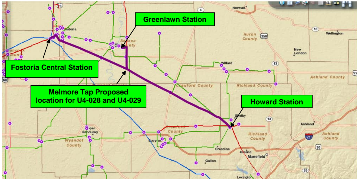
Approximate interconnection location of the proposed facilities