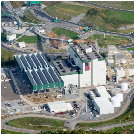
Combined Cycle Generator